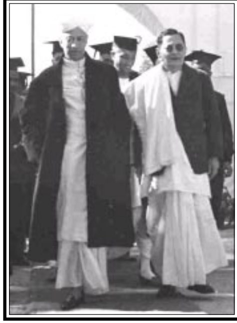
WITH SARBAPALLI RADHAKRISHNAN